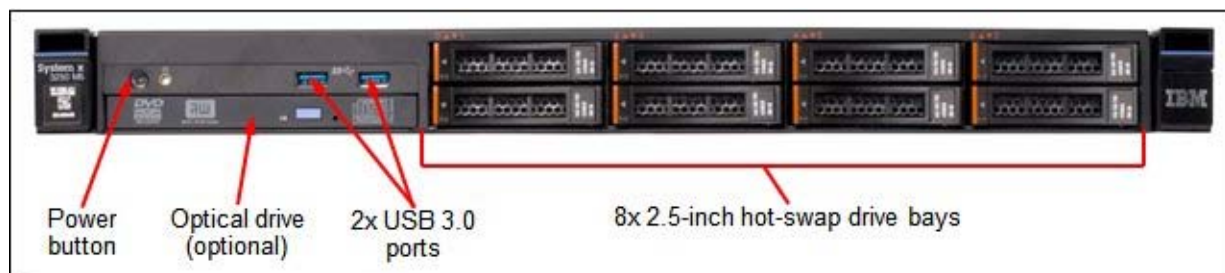
Figure 2. Front view of the System x3250 M5 with eight 2.5-inch hot-swap drive bays

The following figure shows the front of the server with eight 2.5-inch hot-swap drive bays (models with 2.5-inch simple-swap or 3.5-inch simple-swap or hot-swap drive bays are also available).