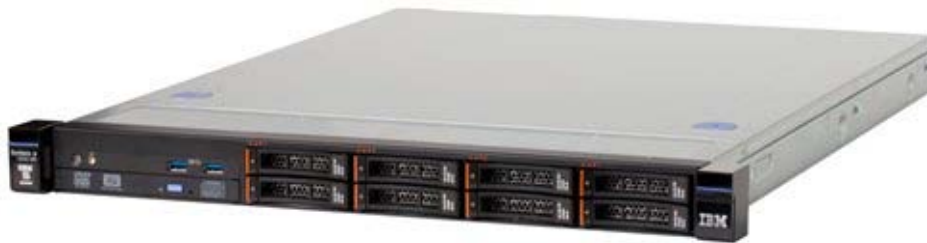
Figure 1. The System x3250 M5

The following figure shows the System x3250 M5.